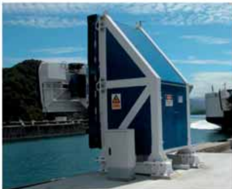
MoorMaster™ is currently in use in Australia, Canada, Denmark, New Zealand and Oman. Compared to lines, the system offers a dramatic reduction in ship motion – for faster loading and unloading.